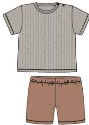
241050 drop needle + single jersey

We believe in creating a collection that ignite imagination, celebrate nature's wonders and provide the highest quality for our little ones.