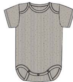
241045 drop needle