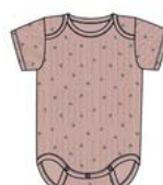
241000 95% single jersey, 5% elastane