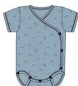
241009 95% single jersey, 5% elastane