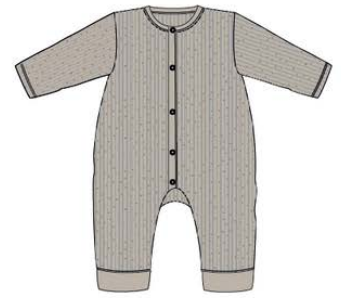
241047 drop needle