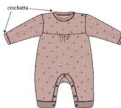
241003 95% single jersey, 5% elastane