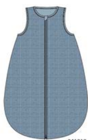
241012 single jersey